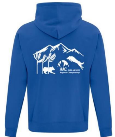
LADIES' General Sizing Guide